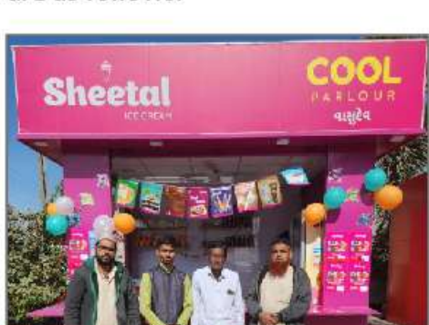
SHEETAL Cool Parlour Sanand, Gujarat (26/1/2023).

Sheetal Parlours are symbols of Sheetal Growth. The inauguration of each parlour proves that Sheetal is heading towards its Vision in a smooth manner. The parlours Inaugurated in the month of January are as follows: