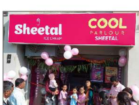
VASUDEV Sheetal Cool Parlour Mangrol, Gujarat (16/1/2023).