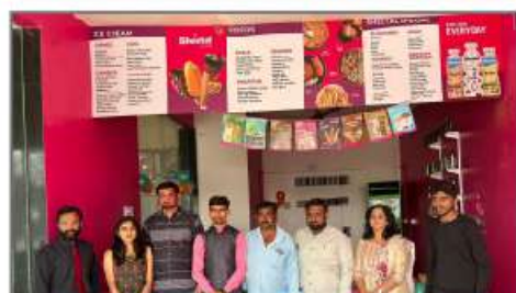
HFC Sheetal Cool Parlour Junagadh, Gujarat (28/1/2023).